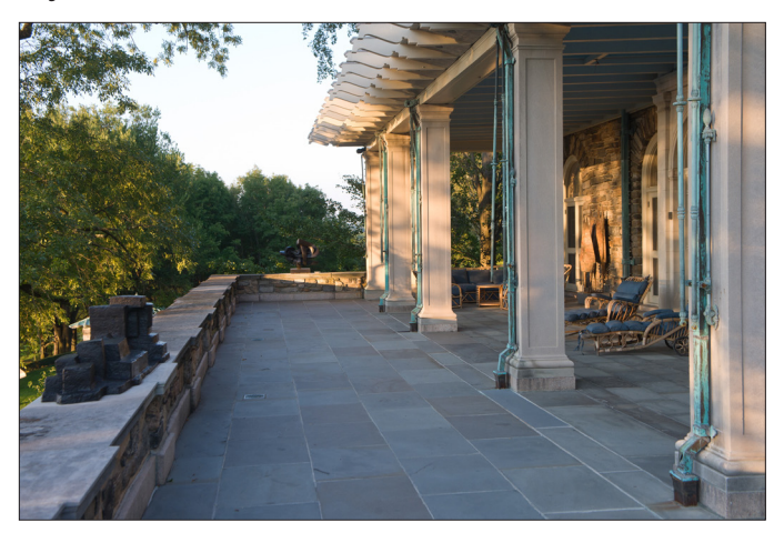
An outdoor reception area overlooking the Hudson River. Available June – August, weather permitting.