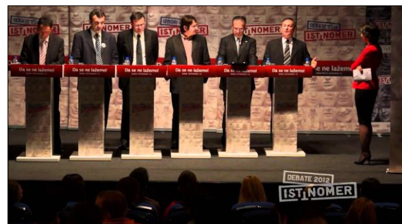
The Center for Research, Transparency, and Accountability's Truth-o-Meter election debate was held in Nis, Serbia, in 2012.