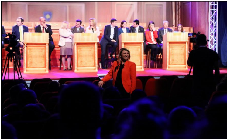
BIRN Kosovo's Jeta ne Kosove organized public debates prior to national elections in 2012.

Accountability has been bolstered because the KJC now has its own monitors throughout the court system and, according to BIRN , the "Office of the Disciplinary prosecutor is competent ... to initiate procedures against judges who violate the code of ethics, or the procedural rights of the parties." 13 BIRN reports that "every month we are getting people fired." Perhaps the greatest impact, however, has been to strengthen the ability of some judges to make tough decisions, thus confronting one aspect of impunity (see quote below).