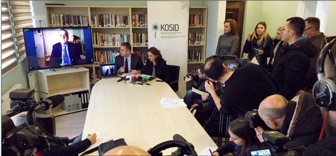
KOSID held a press conference about its opposition to the New Kosovo Power Plant in January 2016.

Beginning in 2010, the RBF brought together a diverse group of Kosovar civil society organizations to discuss concerns arising from the plans to build a new coal-fired power plant, known as Kosovo C. Eventually, a civil society consortium known as KOSID was formed, bringing together RBF grantees INDEP , GLPS , FIQ , BIRN Kosovo , and DokuFest as key members. KOSID has developed a series of policy papers that spotlight potential problems with Kosovo C and present possible alternatives for energy security in Kosovo, such as renewable energy and energy conservation. KOSID has also engaged at the international level with the World Bank, the EU, and the U.S. Congress. As a result, the World Bank sent an inspection panel to look at whether its policies on resettlement were being followed. KOSID is also closely monitoring the World Bank's pending assessment of the environmental impact of developing Kosovo C with the option of petitioning for an additional inspection of whether the project complies with the Bank's environmental standards. Moreover, as a result of KOSID 's work, the government is now more aware of the need to consider international standards in relevant policies. KOSID 's advocacy forced the government to de-bundle investment in mining and Kosovo B and C lignite-powered plants, as it did not comply with the existing competition law; eventually, the package for proposed investment was withdrawn from the pipeline of privatization.