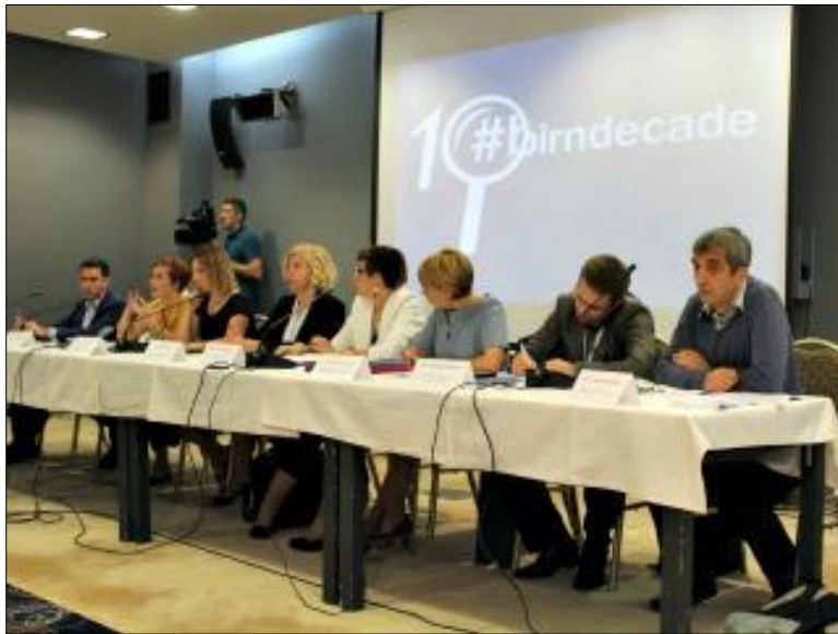
Directors and journalists marked BIRN’s 10th anniversary at a regional conference in Sarajevo in 2015.

Former far-right Serbian nationalists, today known as the Serbian Progressive Party, won Serbia’s parliamentary elections in 2014 by a wide margin. Since then, their leader, Prime Minister Aleksandar Vucic, has succeeded in gaining nearly complete control over the country’s government, economy, and the media. The opposition to Vucic is fragmented, and either very weak or has been co-opted by him.