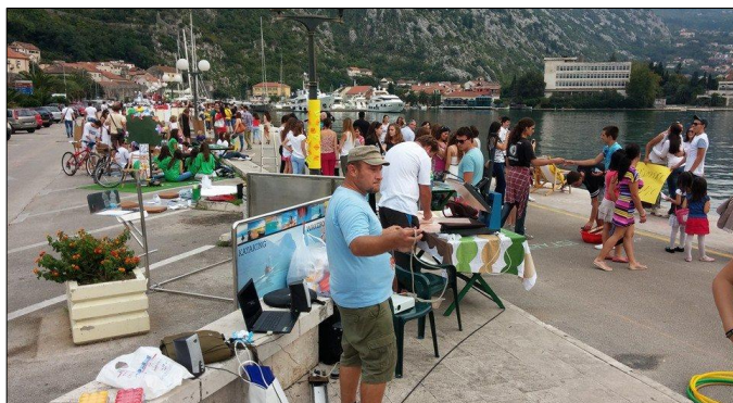
Expeditio participated in the 2015 PARK(ing) Day in Kotor, Montenegro. PARK(ing) Day is an annual, global event where citizens turn parking spaces into temporary public parks to promote civic engagement and creativity.

As far as we could ascertain, Serbia has not made a notable effort to develop strategies for sustainable development. In Montenegro, the Expeditio Center for Sustainable Spatial Development , which works to encourage sustainable, spatial development, has participated in the development of the 2005–2012 Sustainable Development Strategy. Also, it developed the monitoring mechanisms for the implementation of the strategy. In addition, it participated in the design of the 2015–2030 National Strategy for Sustainable Development. Furthermore, Expeditio will help develop monitoring mechanisms and indicators. In Kosovo, we noticed some success in both energy strategy and ensuring that EU standards, including those related to sustainable development, are taken into account in other strategic areas; however, there is no overarching strategy for sustainable development.