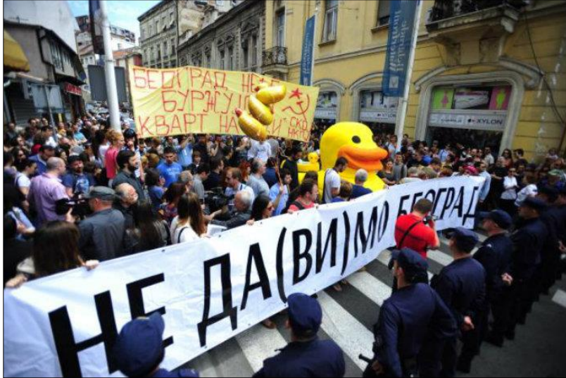
Mikro Art has raised public awareness on issues such as the Belgrade Waterfront Development. Pictured here is a protest against the controversial project in 2015.

In Serbia, Mikro Art has focused on issues of public access to and use of public property. Along with other groups, including CRTA , Mikro Art has successfully raised public awareness on a number of issues, including the controversial Belgrade Waterfront Development 30 (see Goal 1 for more detail). Likewise, Expeditio in Kotor, Montenegro, has successfully managed to get the public engaged on issues of spatial urban planning and new construction at the municipal level.