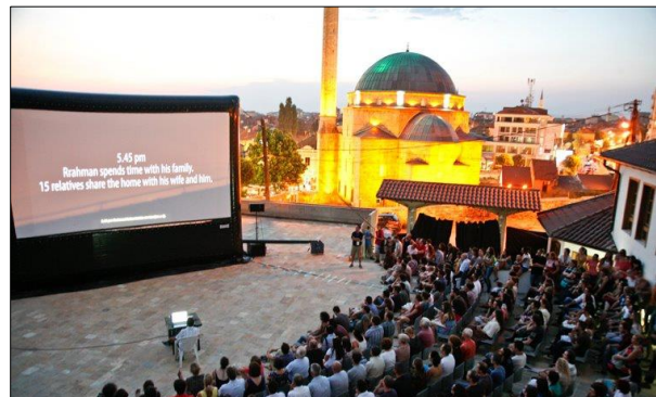
DokuFest, a documentary film festival takes place in Prizren, Kosovo, annually.