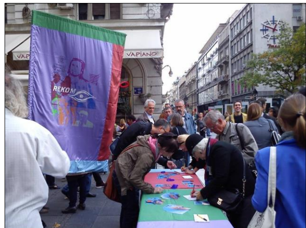
The Humanitarian Law Centre collected signatures in Belgrade supporting the establishment of RECOM in 2014.

The RBF has been supporting the Coalition for RECOM since 2009 as an initiative that cooperates across the region to face the past (see text box, Regional Commission for the Establishment of Facts about War Crimes and Other Serious Violations of Human Rights [RECOM] ). The Coalition for RECOM has close to 2,000 members across the region. All of the governments in the region, with the